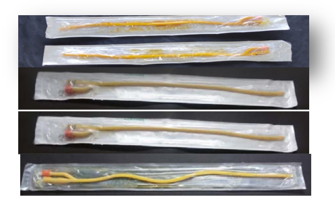
Antimicrobial and antibiofilm urinary catheters